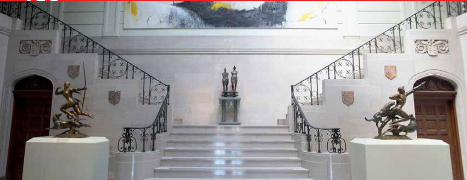
The David Owsley Museum of Art at Ball State University.