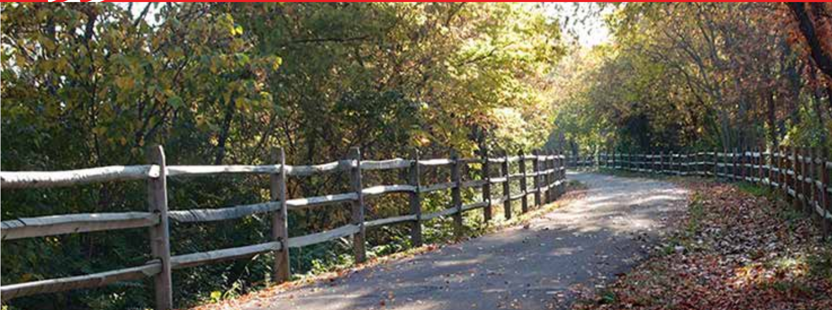
The Cardinal Greenway, featured in Community Connection .