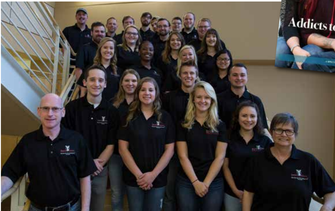
Members of the “Unmasked” team and above, the companion magazine.