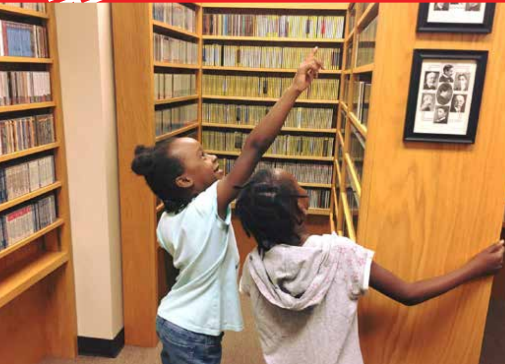
Students from Motivate Our Minds get special access to IPR's music library.