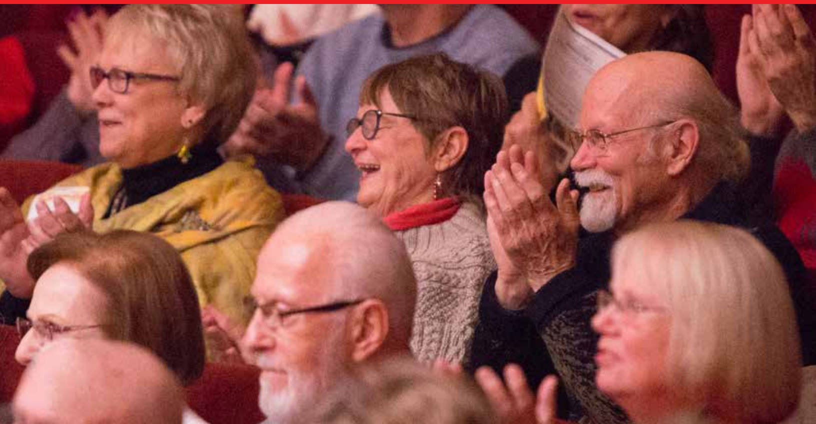
Audience members enjoying IPR's Radio Drama, A Christmas Truce .

“Thank you for all the news and information you bring to the community.